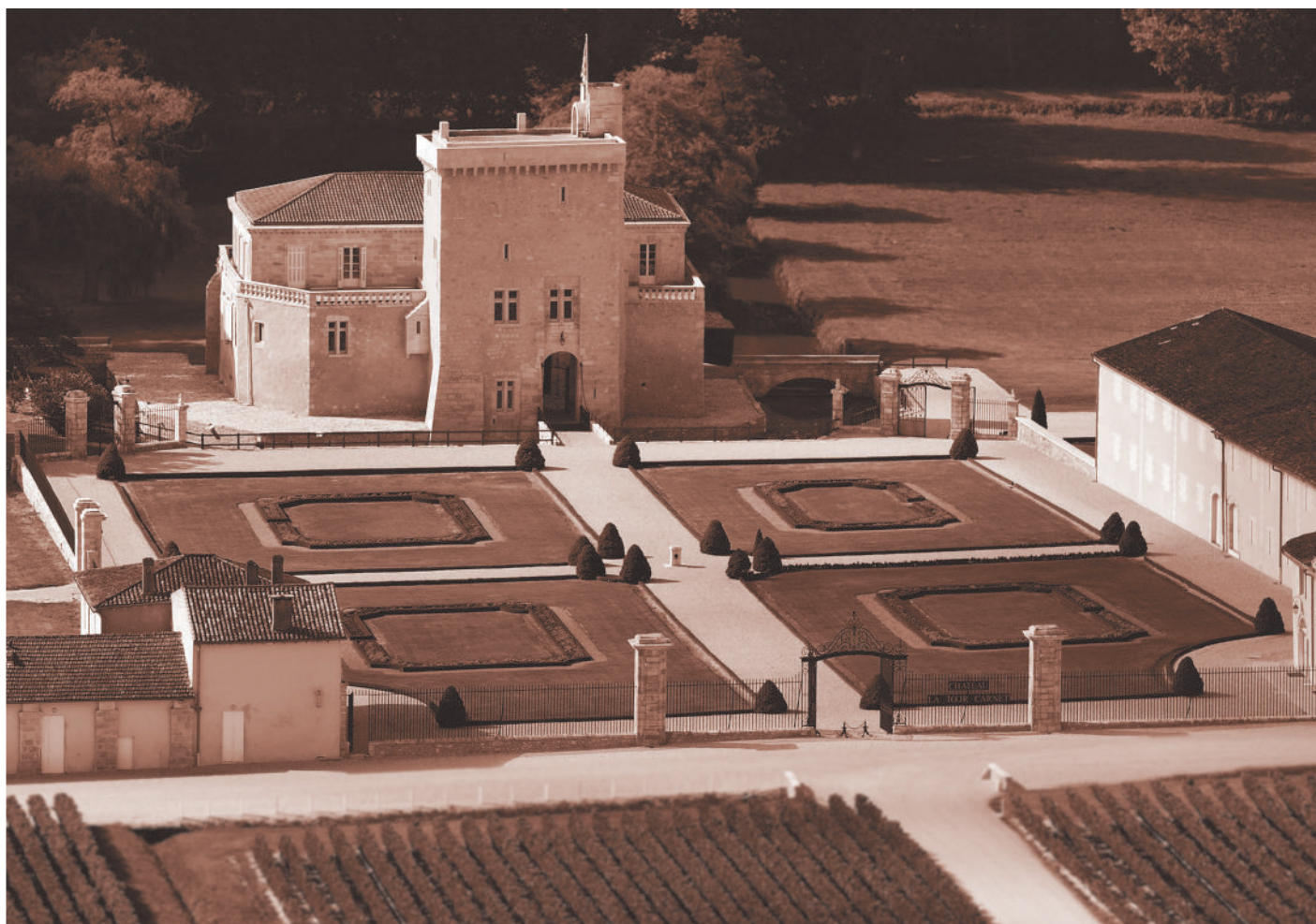
Château La Tour Carnet