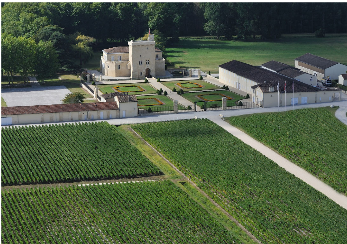
Le Château La Tour Carnet