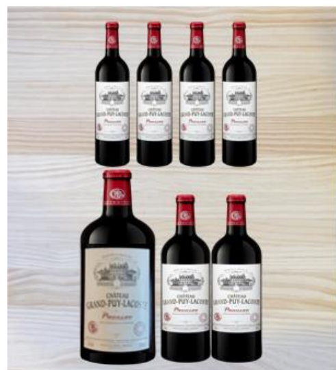
Caisse Variation (9L)