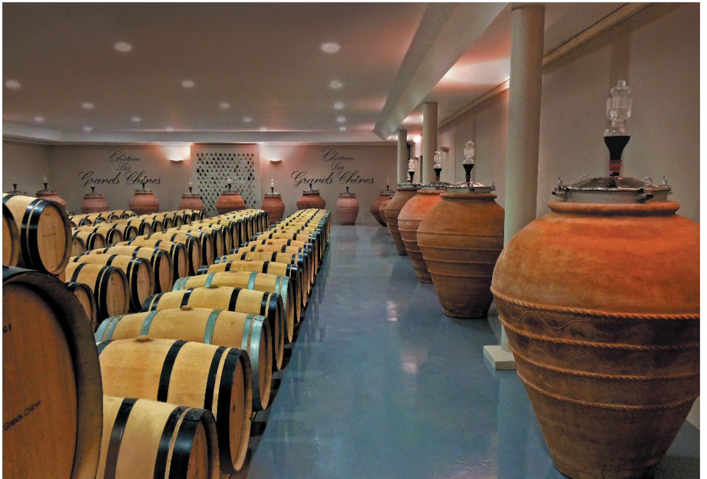
Château Les Grands Chênes