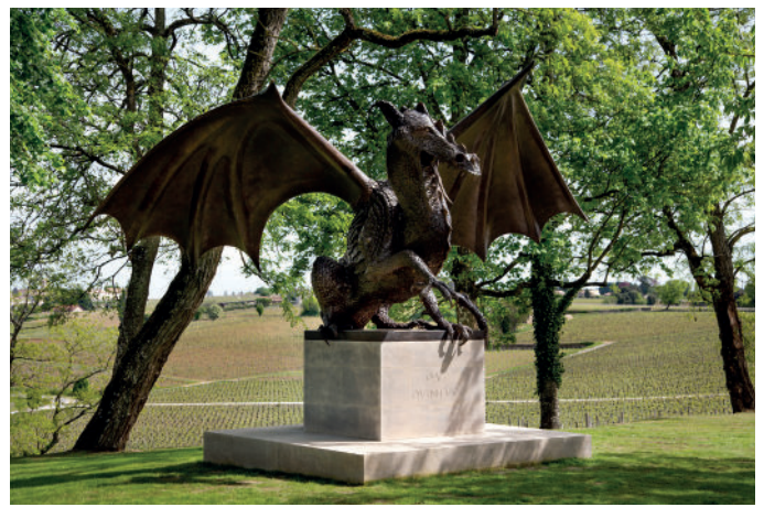
Château Quintus Dragon statue

Harvested from September 19th to October 9th