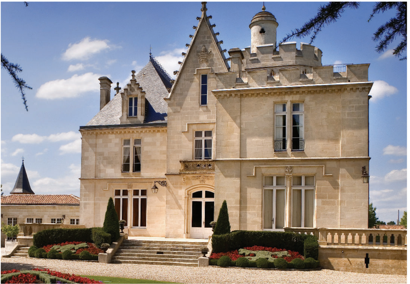
Le Château Pape Clément