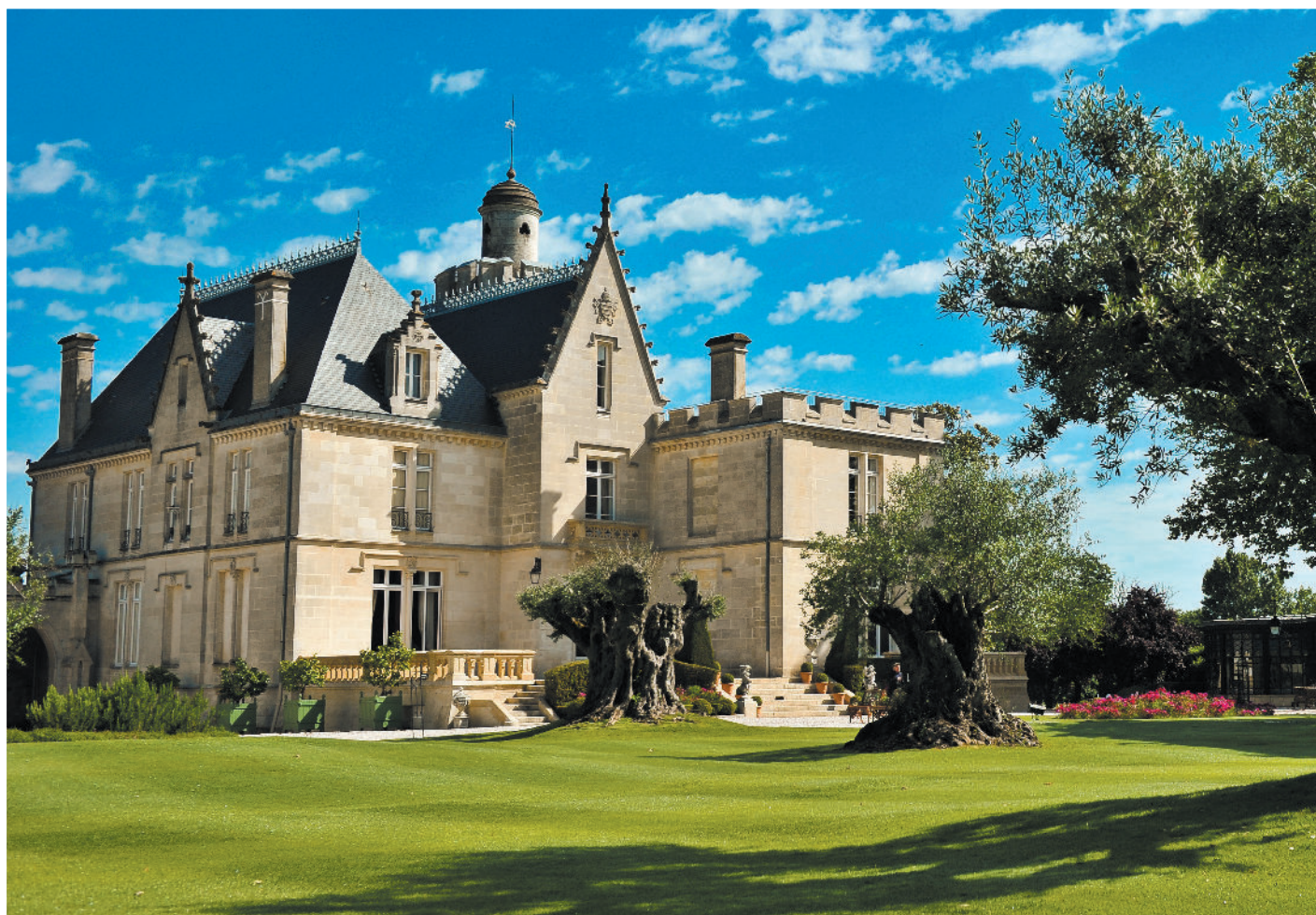
Château Pape Clément