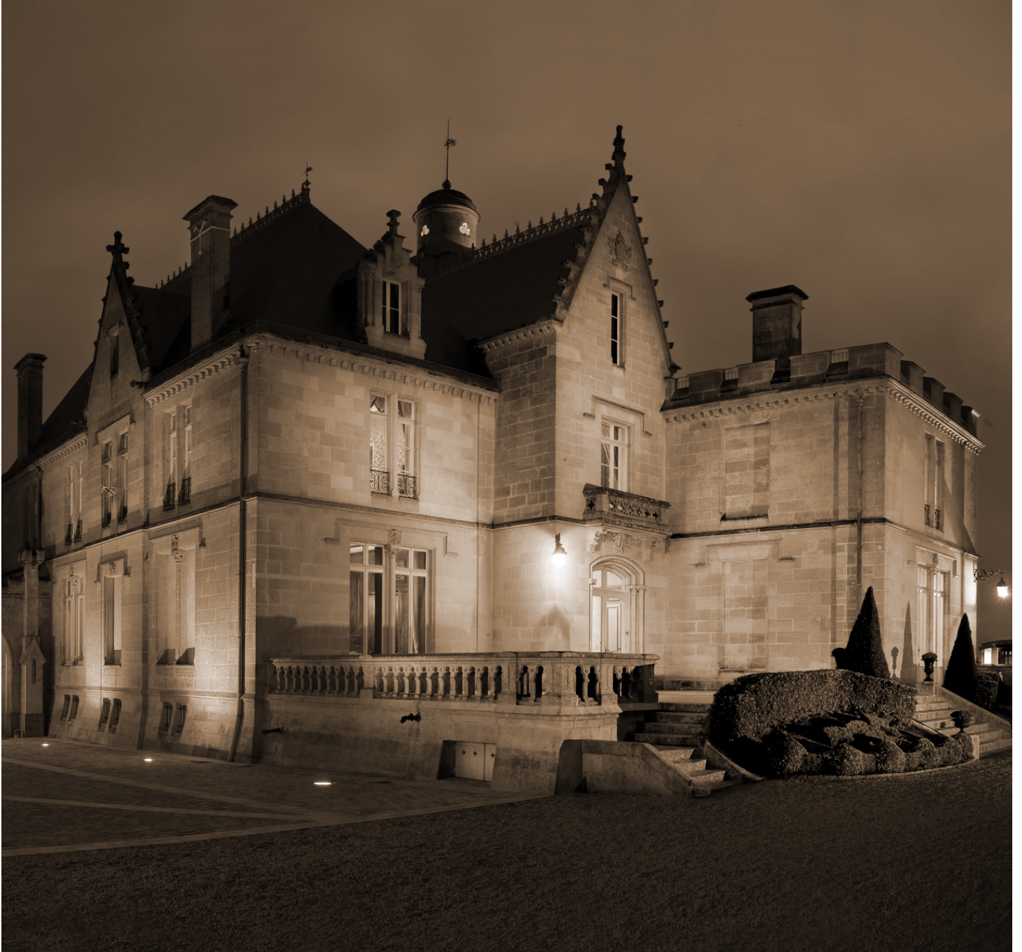
Château Pape Clément