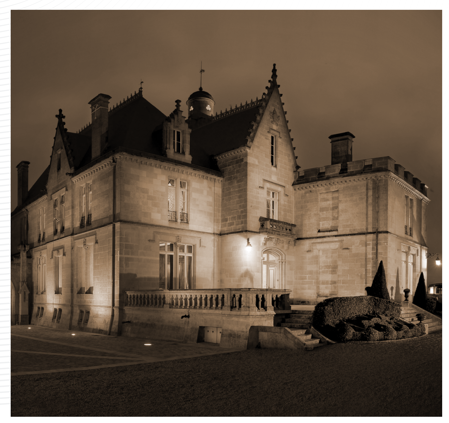
Le Château Pape Clément